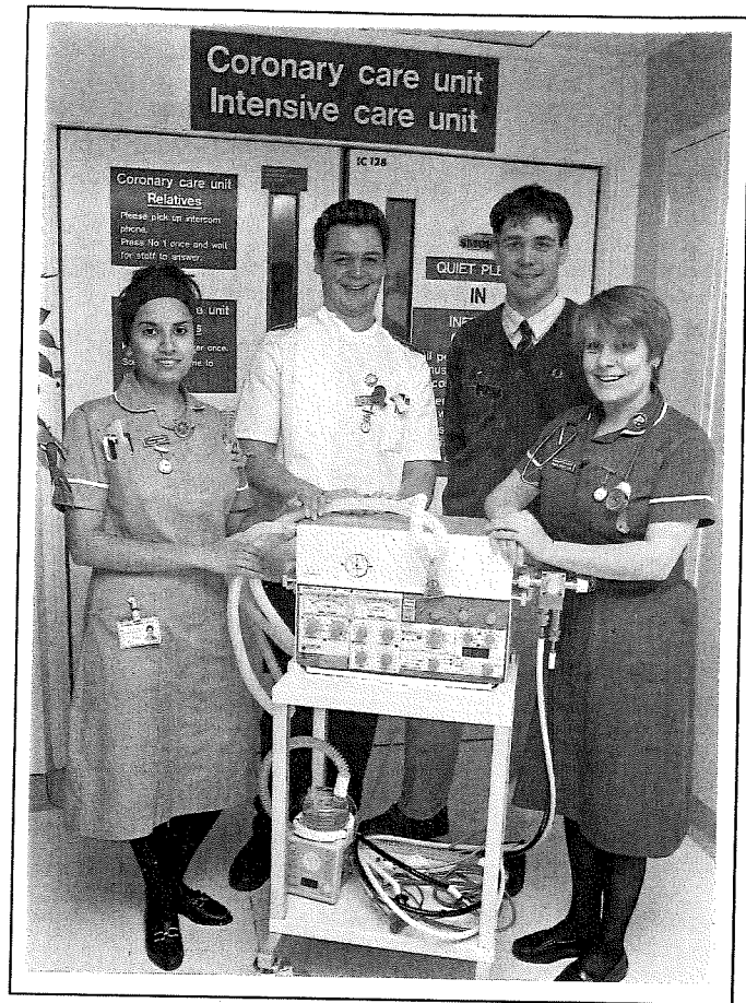
Staff from the Coronary care unit, photographed with a new ventilating machine, in November 1993.